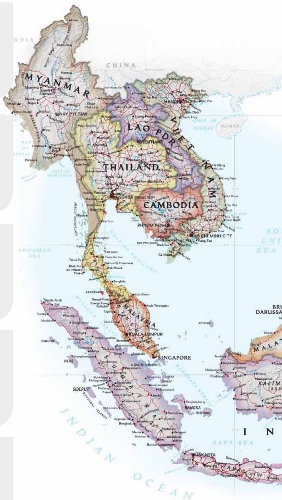
National Geographic Indonesia for ASEAN Tourism Map

Population (2011 estimate): 87.8m Capital city: Hanoi (6.5m) GDP growth (2012): 9.0% Inflation (2012): 9.2% Main industries: Rice, coffee, rubber, cotton