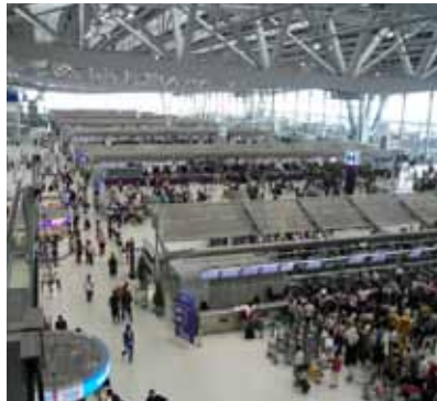
Suvarnabhumi Airport, also known as Bangkok International Airport

Of the 15 prioritised projects outlined in the Master Plan on ASEAN Connectivity (MPAC), one is focused on boosting tourism in the region. It deals with easing visa requirements for ASEAN nationals in order to facilitate mobility of people and tourists and possibly involve visa exemptions for intra-ASEAN travel by ASEAN nationals in all member states.