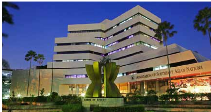
ASEAN headquarters in Jakarta, Indonesia

To take a brief step back, one of the purposes of the ASEAN Charter, which was agreed at the 13th ASEAN Summit in November 2007, was to create a single market and production base. It was recognised that better connectivity of transportation networks would help create a more competitive and resilient ASEAN – bringing people, goods, services and capital closer together. The Master Plan was